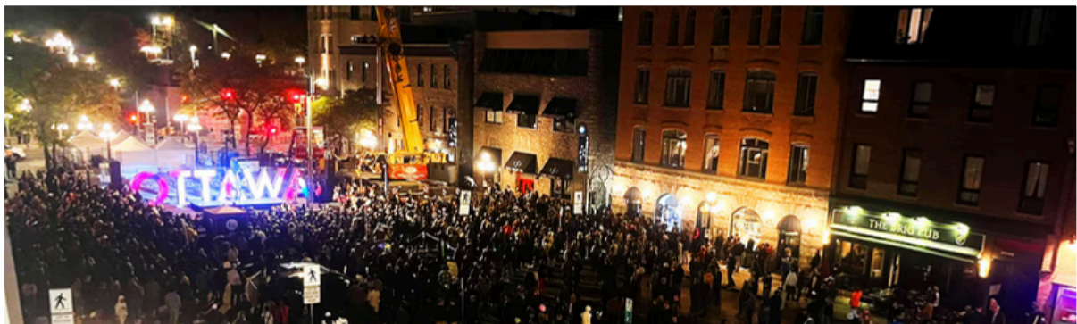
Nuit Blanche teaser activation on York Street, 2025

In parallel, the Nightlife Office collaborated with cultural partners to deliver a Nuit Blanche teaser activation, aimed at building public awareness, and generating momentum for the full festival in 2026. The Mobile Homme show on October 17, 2025, in the ByWard Market attracted more than 3,000 spectators. The return of the full Nuit Blanche experience is scheduled for September 26, 2026, as part of the 200th anniversary celebrations of the founding of Bytown.