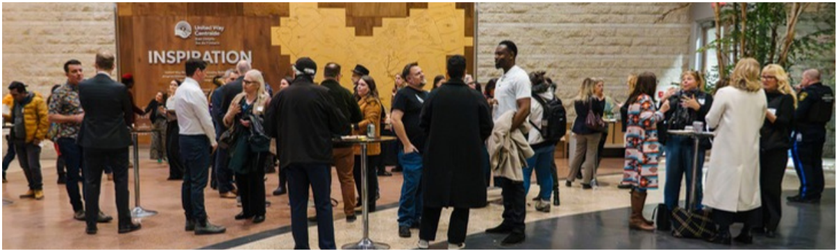
Nightlife Town Hall at City Hall, 2025

In 2025, several by-law changes were approved by Council to facilitate special events and support licensed businesses. Those changes included: