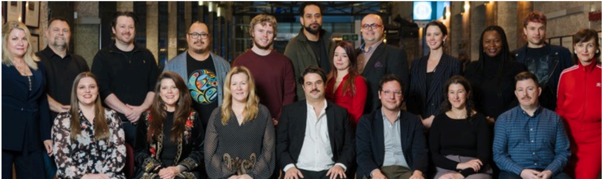
City of Ottawa Nightlife Council, 2025

The Nightlife Council was established in January 2025 following an extensive recruitment process that attracted 500 applicants from across Ottawa. The Council is composed of 18 members, including six seats specifically reserved for representatives from economic and cultural development organizations. The primary role of the Nightlife Council is to enhance communication and collaboration between the City, nightlife businesses, and residents, while providing strategic guidance and support to the Nightlife Commissioner and the Nightlife Office.