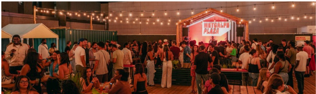
Metcalfe Plaza, 2025

The Nightlife Office played a central role in supporting the funding, planning, and implementation of Metcalfe Plaza, working in partnership with the Downtown Business Improvement Area, Aire Commune, and Amashowza. This seasonal public-realm activation was designed to animate downtown Ottawa through recurring cultural programming, food and beverage offerings, and inclusive nightlife experiences.