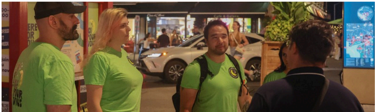
Nightlife Ambassadors in ByWard Market, 2025

While the majority of engagements (86 per cent) focused on general outreach and positive engagement—helping build trust, provide information, and increase awareness—the program’s interventions related to aggression or conflict (four per cent), lost or vulnerable individuals (three per cent), and medical or substance related issues (three per cent), though smaller in proportion, represent critical contributions to community safety and harm reduction.